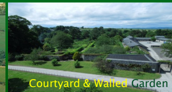
Courtyard & Walled Garden

Why Come? – There are many Men's Groups in Ireland, supporting men in all corners, some in isolation. We want to get together to help support one another, improve communications, & forge bonds that might last a lifetime. We want to see Men's Circles up for every man in Ireland! What better way to build connections than to work, play, feast, learn, & visit the Shadow together? We promise a very good time, with great gifts of the mind & heart for each man.