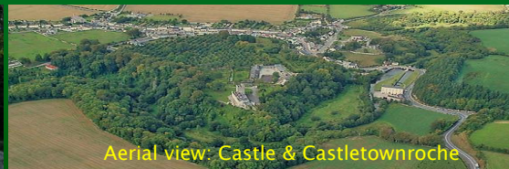
Aerial view: Castle & Castletownroche