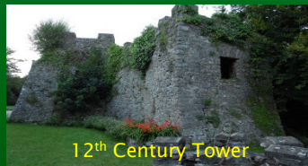
12 th Century Tower

Food: Free Feast on Saturday! For Sunday: €5.00, or bring food for 3 men (coord. this with Staff)